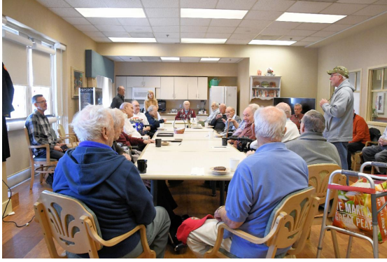
Veterans attend Oak Crest Vet Café