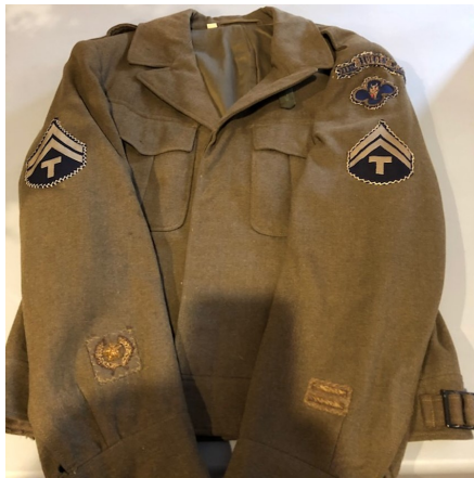
Norman's Original Eisenhower Jacket