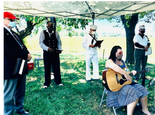
Salute to Service Tribute held outside