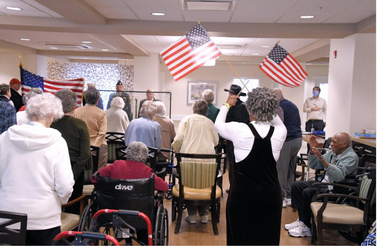
Charlestown's Wilton Overlook residents singing the National Anthem.