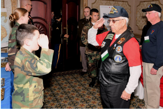
Member of the Young Marines saluting a Vietnam Veteran