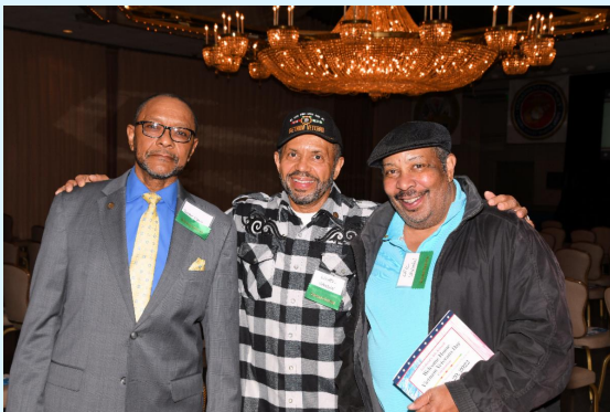
Vietnam Veterans enjoying the Welcome Home celebration