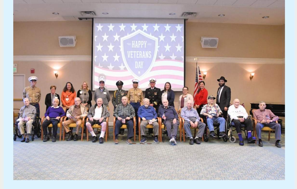
Gilchrist team with the veterans at North Oaks