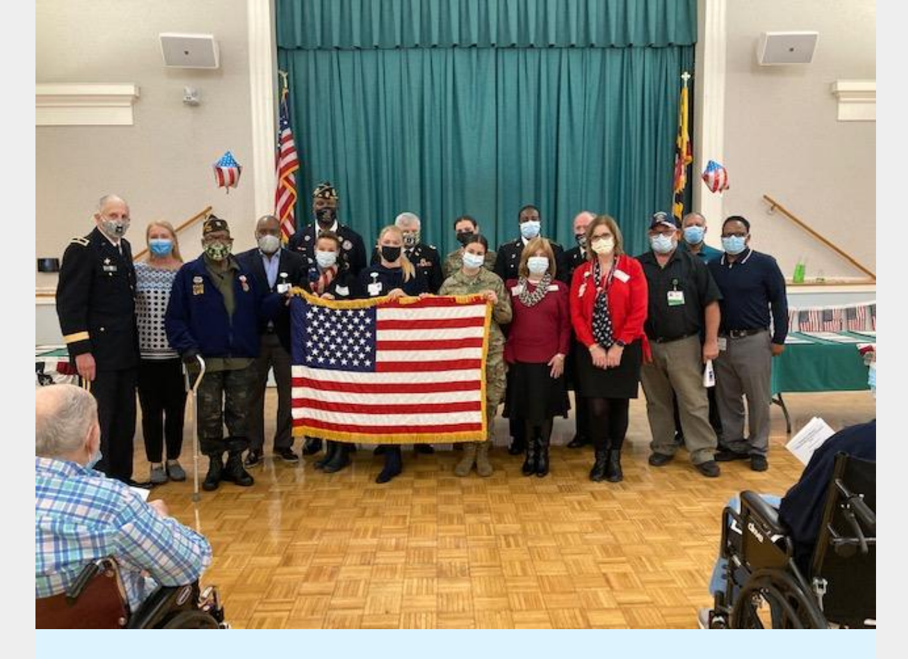
Gilchrist team honoring veterans at Keswick