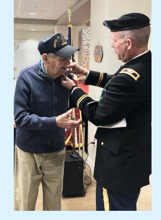
Pinning a veteran at Charlestown Senior Living