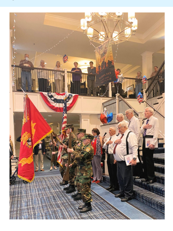
Young Marines and Calvary United Methodist Church Singers assisting with the Veterans Day event at Brightview Annapolis