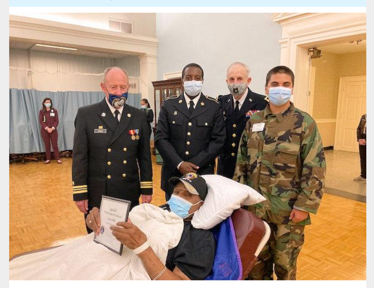
Honoring a veteran at Keswick