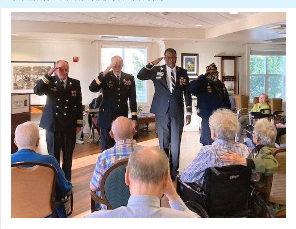
Veterans Day ceremony at Symphony Manor