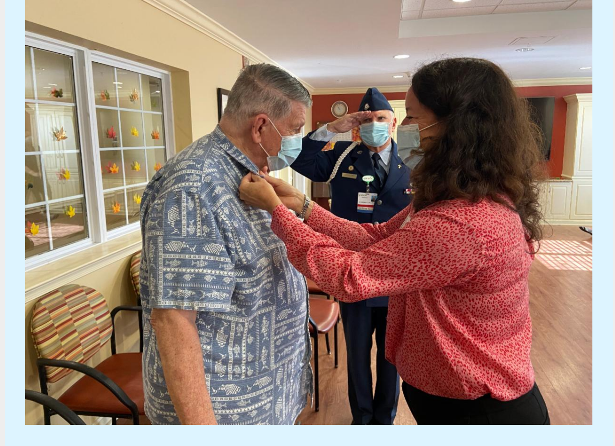
Pinning and saluting a veteran at Brightview Whitemarsh