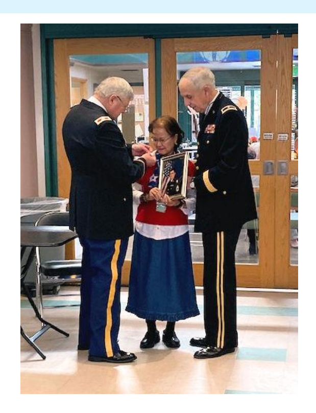
Honoring the wife of a deceased veteran at Seven Oaks Senior Center