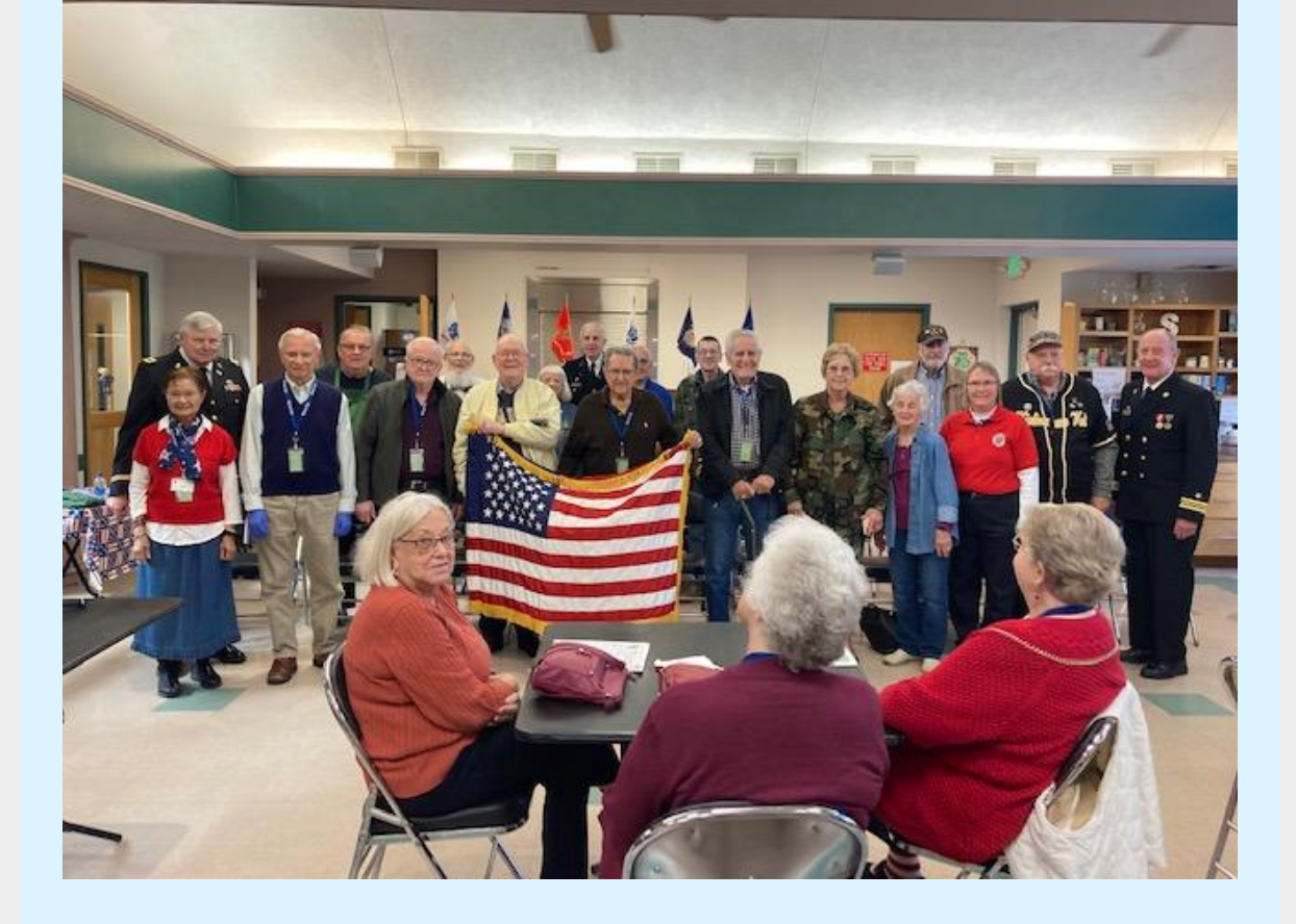
Gilchrist Team at Seven Oaks Senior Center