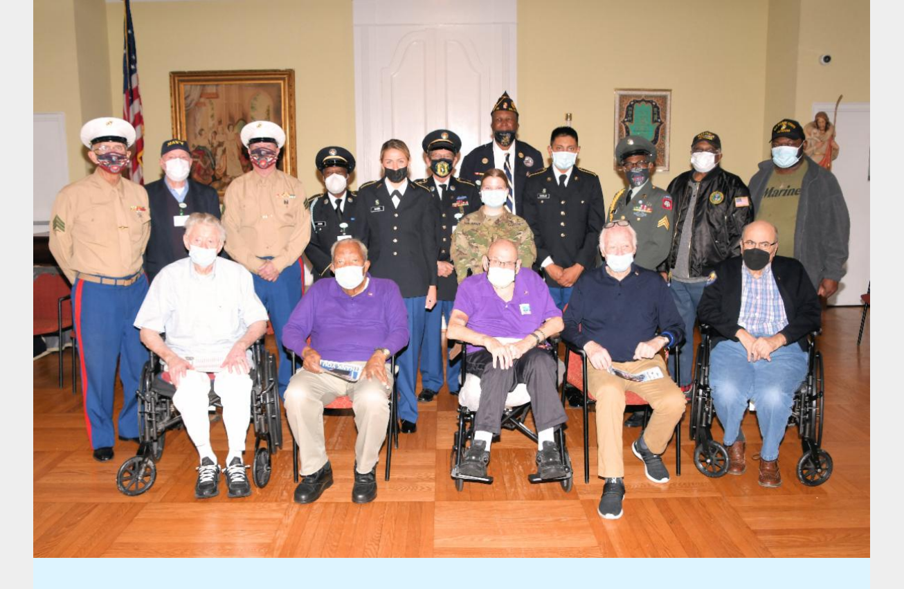
Honoring Veterans at Springwell Senior Living