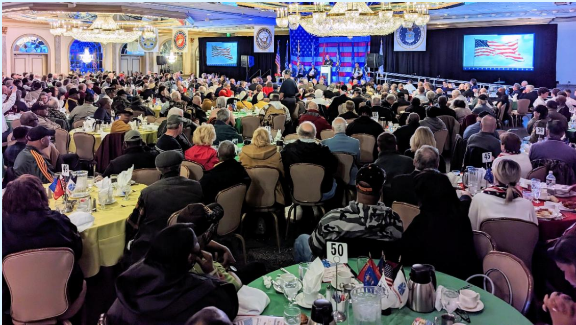
Welcome Home Vietnam Veterans Day Celebration