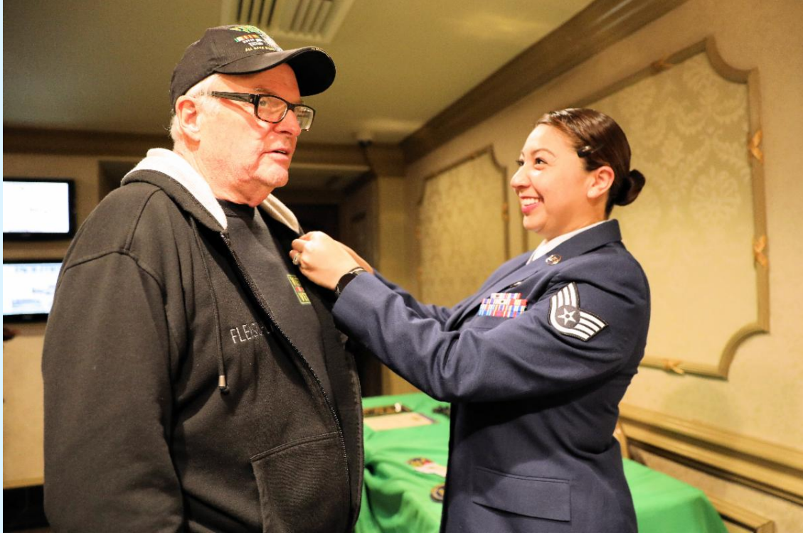
Pinning of a Vietnam Veteran