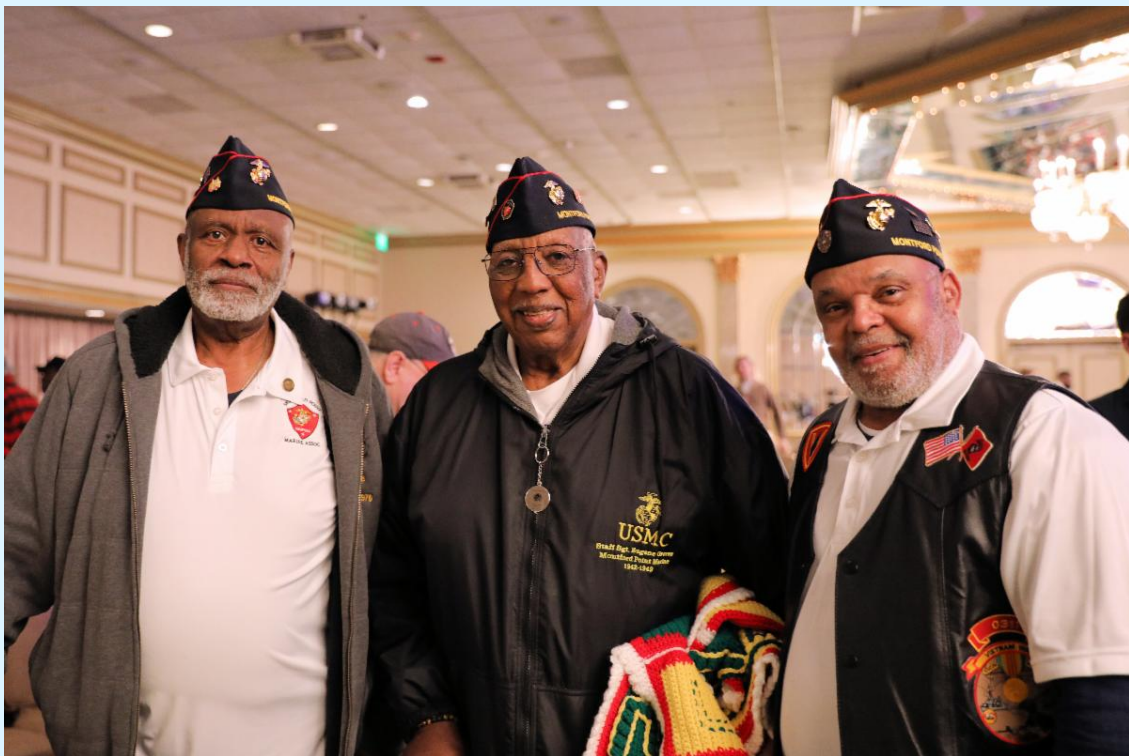
The Marines have landed!