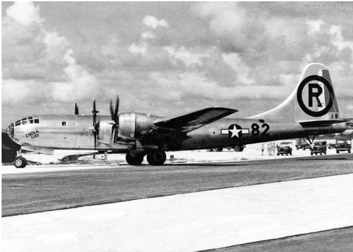
Enola Gay at Tinian in 1945