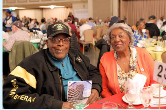
Enjoying the celebration