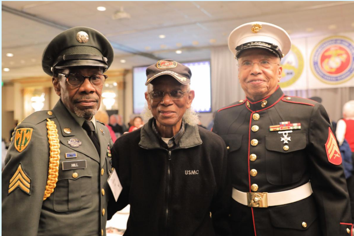
Still looking sharp 50 years later