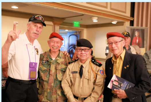
Members of the Army of the Republic of Vietnam visiting with Vietnam Veterans