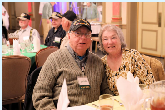
Enjoying the Welcome Home event