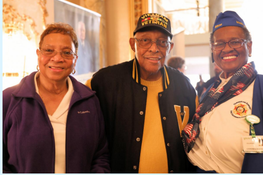
Enjoying the Welcome Home event