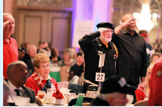
Veterans Saluting as their military song is played