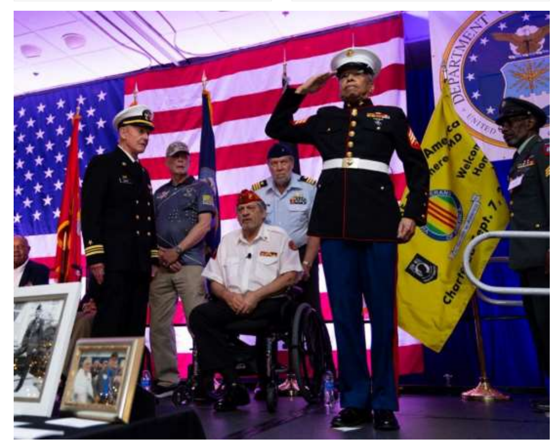
Military branch representatives saluting during the United States Armed Forces Medley