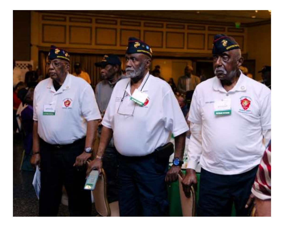
Montford Point and Vietnam Veteran Marines