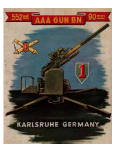
Emblem of the 552nd AAA Gun Battalion